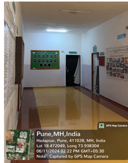
Figure 2: LED Fittings