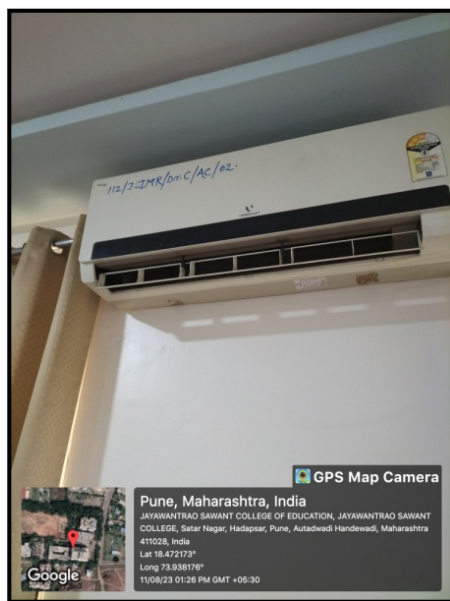
Figure 3: STAR Rated Equipment