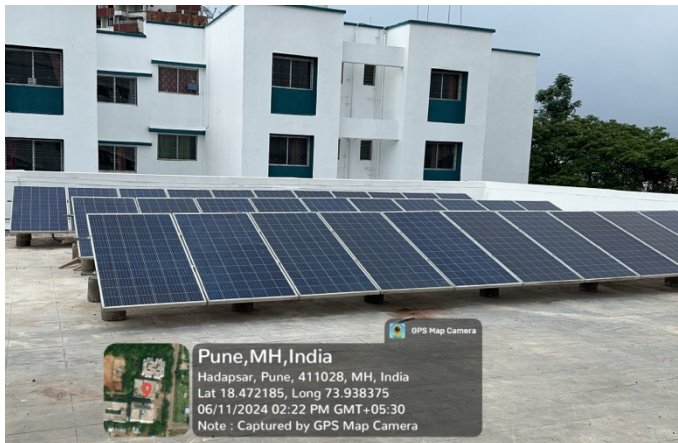
Figure 1: Rooftop installed Solar PV Plant